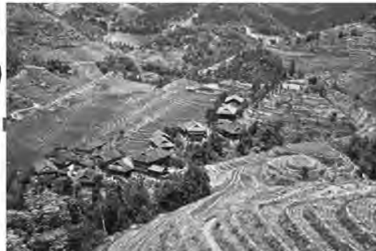
Research site in Guangxi, Yunnan and Guizhou provinces. The photo shows a typical landform in this region.

macy of their rights/claims to benefit-sharing. The development of ABS mechanisms is also feeding into ongoing policy discussions on how to implement the ABS provisions of the Convention on Biological Diversity and the Nagoya Protocol.